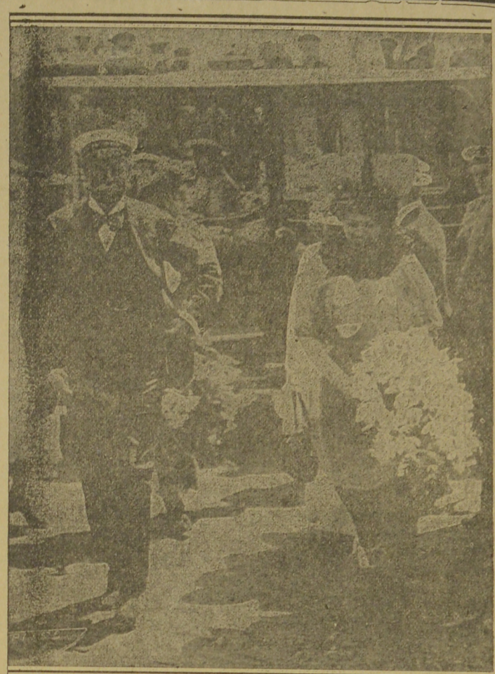
View of people hurrying for cover when the alarm is given of a zeppelin raid

4. Look out for lighted tobacco and matches. They don't look dangerous but they cost Canada millions of mon- ey and many lives every year.