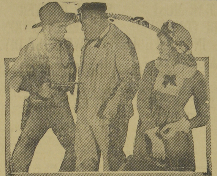
VIVIAN MARTIN in "Unclaimed Goods" A Paramount Picture

There is the chance for the fighting spirit to show itself with honor.