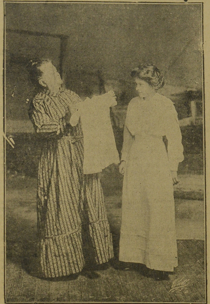
Scene from "Pals First," as presented by the Urban Stock Co.

Manufactured by the Minard's Liniment Yarmouth, N.S.