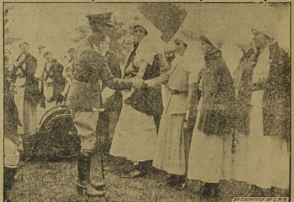
THE PRINCE VISITS ST. ANDREWS HOSPITAL, OFFICERS' SECTION