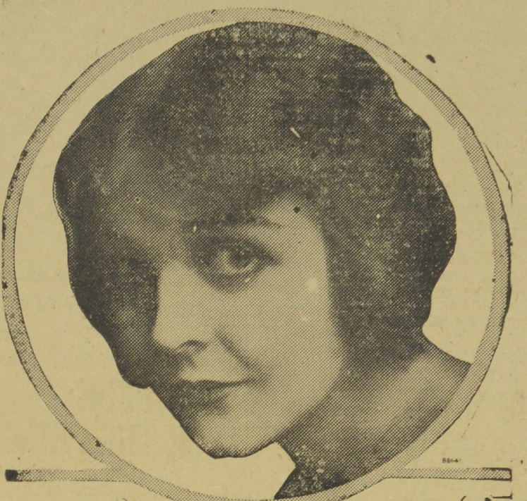
Enid Bennett in "The Law of Men"

Matinee, 3 p.m. Evening, 7.15, 8.45 p.m.