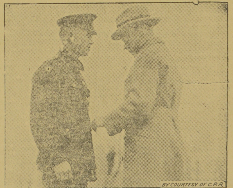
The Prince Decorating Veterans at Portage La Prairie.