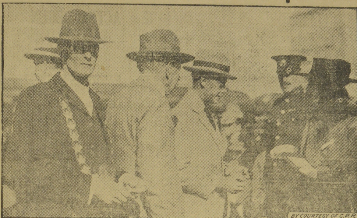
THE PRINCE SIGNS AU TOGRAPH FOR SCHOOL TEACHER AT MAPLE CREEK, SASK.

J. STEVENS ARMS COMPANY Chicopee Falls, Mass., U. S. A.