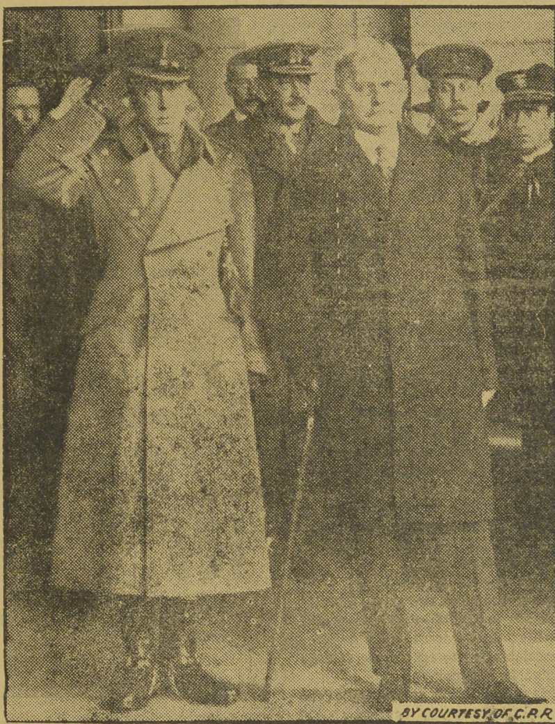
The Prince with Vice-President Marshall and Party Stand at Attention While the Band Plays "God Save the King."

Apple drying and evaporating mills as well as a few small canning fac-