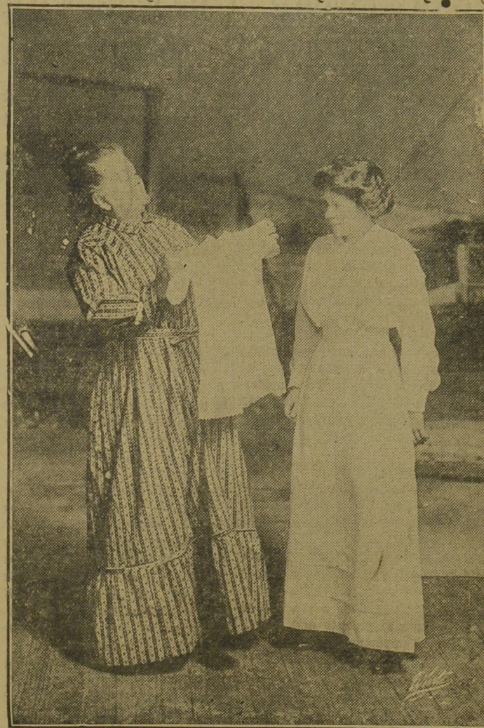
Scene from "Pals First," as presented by the Urban Stock Co.

Another cake that kept moist and soft for a long time was this dried apple cake. Soak two cups of dried apples over night, drain and cook for two or three hours very slowly on the back of the stove with two cups of molasses. When cool they are ready for use. A cup of shortening creamed with two cups of sugar, then two well-beaten eggs, a cup of milk and five cups of flour are added. The apples, spices to taste, two teaspoonfuls of cream of tartar and one of soda and raisins, if desired, two cups of them, are stirred into it. This will make two cakes.