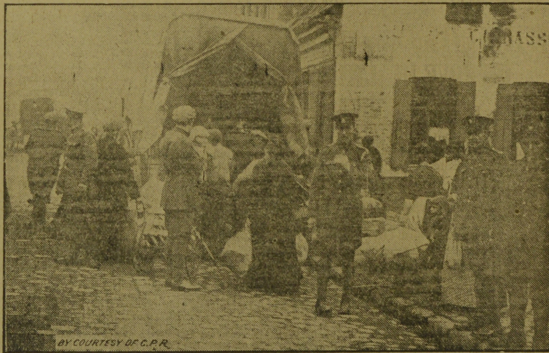
British troops taking back the civil population to their original homes.