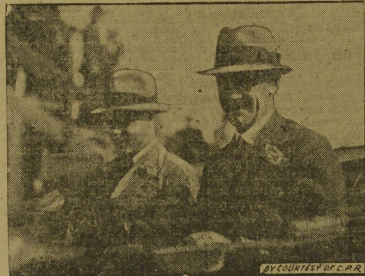
The Prince at a Ball Game in Edmonton.

The troopship Plattsburg arrived here on last Aug 29 and is at present anchored off Bay Ridge. The Army Information Service knew nothing of the nine stowaway girls.