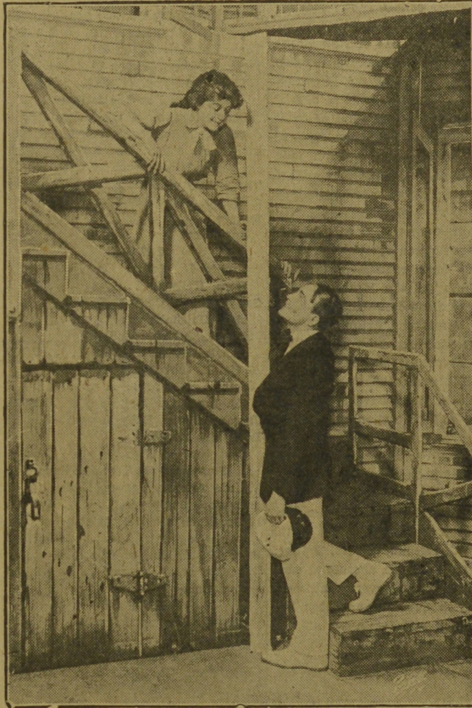
Scene from "Pals First," as presented by the Urban Stock Co. Wednesday Night, October 1st.

Lots of bright hopes are exchanged for gloomy experiences. z z z Some persons are ruined by the high cost of living, and others by the high cost of living up to the way the neighbors are living.