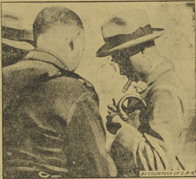
The Prince Busy With Signatures at Edmonton.

Somebody ought to get out a book explaining how to tell the Russian front from the Russian rear.