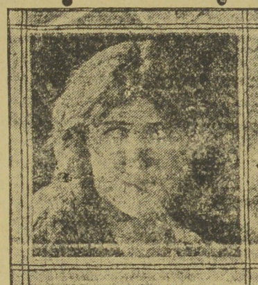
MARY MAC LAREN "THE UNPAINTED WOMAN"