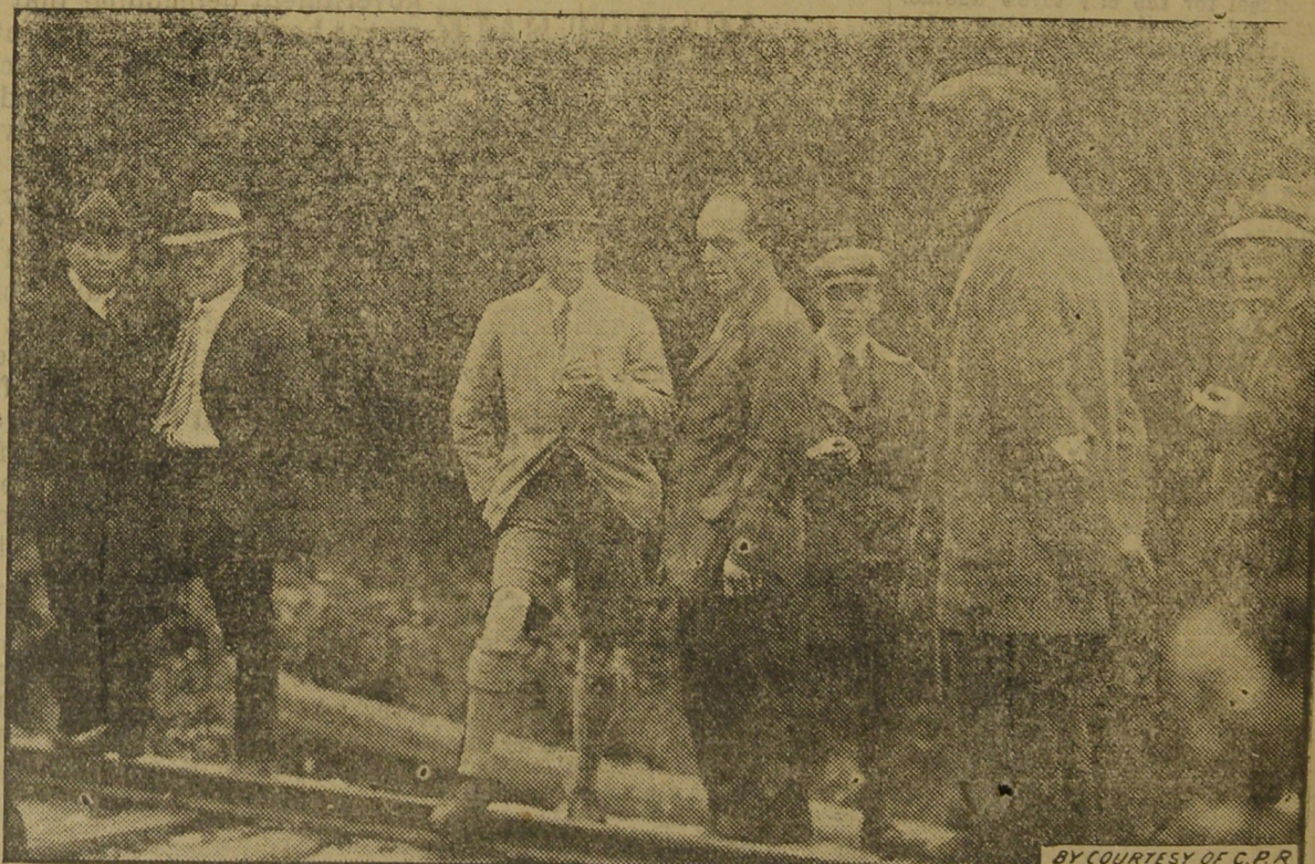
THE PRINCE AT NIPIGON.