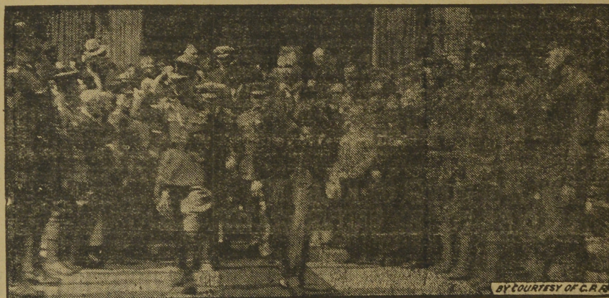
PRINCE LEAVING TORONTO EXHIBITION OFFICES.