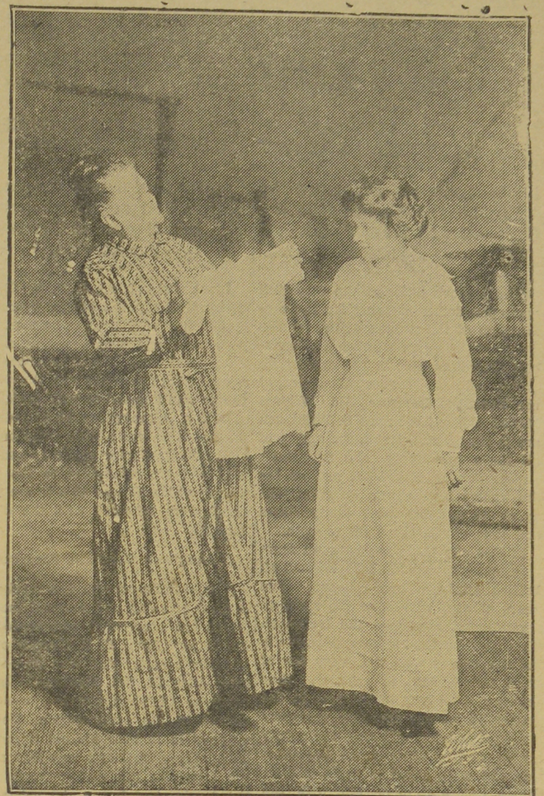
Scene from "Pals First," as presented by the Urban Stock Co.