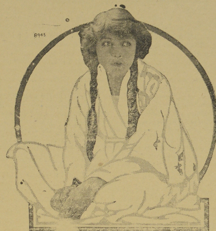
Enid Bennett in "The Haunted Bedroom"

Her newspaper career had taught her the mysteries of the night but—