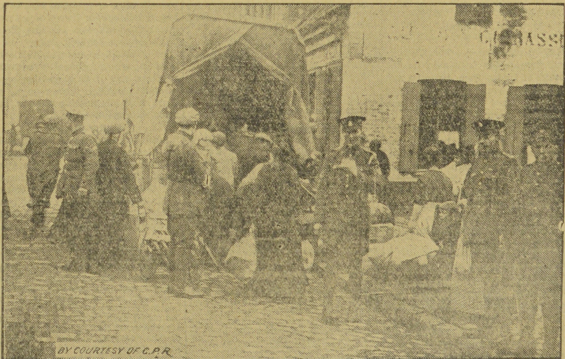
British troops taking back the civil population to their original homes.