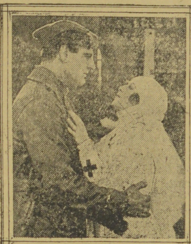
"THE HEART OF HUMANITY" Allen Holubar's Super Production starring DOROTHY PHILLIPS

Stupendous in theme. A veritable revelation of ending wonders. A story of love that passes all understanding. We are offering you something greater than you have ever seen. It's the mightiest of the mighty—the greatest of the great and the most soul-stirring drama ever filmed.