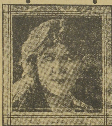
MARY MAC LAREN "THE UNPAINTED WOMAN"

He saw her as she came away from the doctor's office with her fate written in her face—deaf for life—and he fell in love at first sight. Yet he didn't know she was deaf—nor did she know that he was to give her back her hearing.