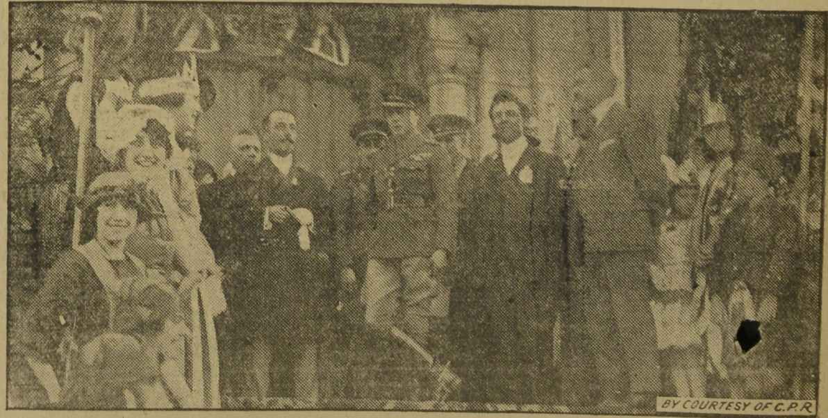
THE PRINCE RECEIVED AT OTTAWA