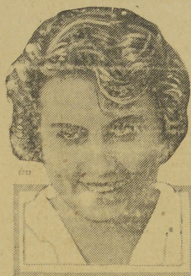
Thos. A. Ince presents DOROTHY DALTON in "The Home Breaker" A Paramount Picture

Miss Dalton appears as a travelling saleswoman, and the part offers her opportunity for some clever comedy work.