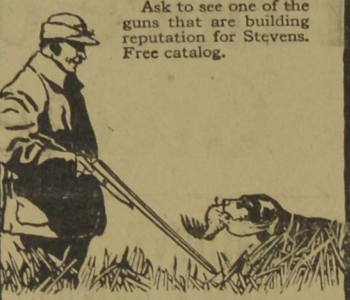
J. STEVENS ARMS COMPANY Chicopee Falls, Mass., U. S. A.

Barrels and lugs drop-forged in one piece. Bored by a method that insures long range close shooting. Fore-ends that will not loosen and will keep the barrel tight.