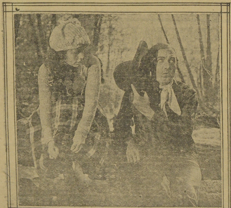
HARRY CAREY in "A FIGHT FOR LOVE"

Author of "Confessions of an Everyday Wife," now running as a serial in The Daily Mail.