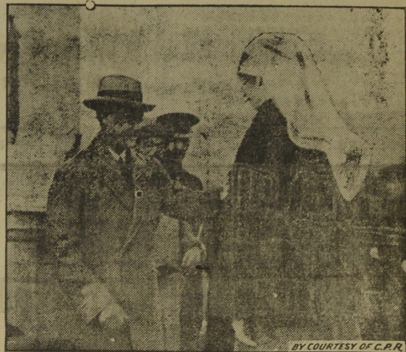
PRINCE DECORATING NURSE IN FRONT OF CITY HALL, BRANDON.

The building up, primarily under State Law, of a system of personal credit unions, for farmers whose financial status and operations make it difficult to secure accommodations through the ordinary channels; expansion of facilities for aiding in marketing, especially extension of the market news and food products inspection services; continuation of Federal participation in road building through an appropriation of $100,000,000 for each of the next four years; regulation and control of stockyards and packing houses; Federal legislation to protect consumers against adulterated feeds and fertilizers; increased state support