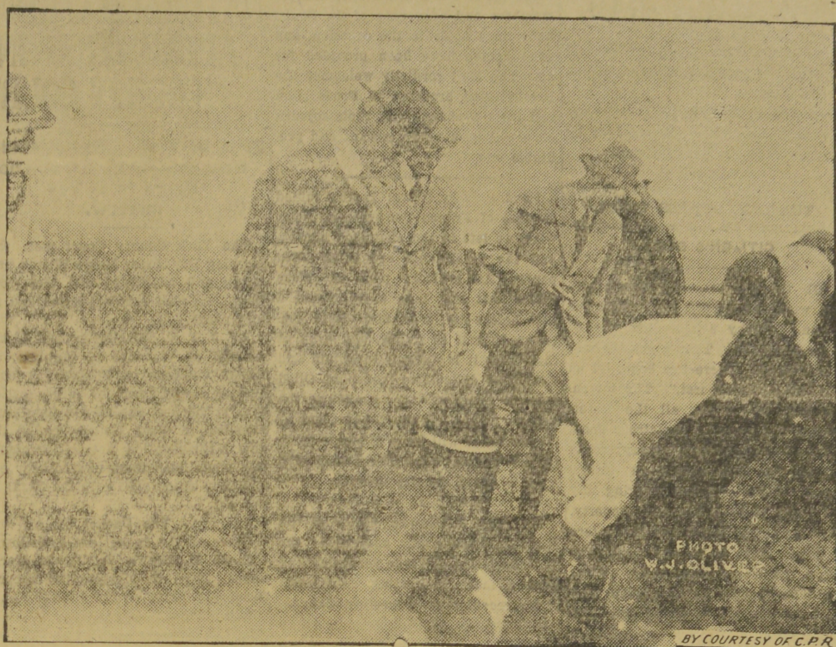
The Prince Watches the Branding of a Calf on Bark Ranch, High River, Alta.

Although it is quite likely that a new record in gate receipts may be established in the present nine game series it is doubtful if the player's share will equal the record established in 1912 since the new distribution arrangement requires that one quarter of their pool go to proceeds of five