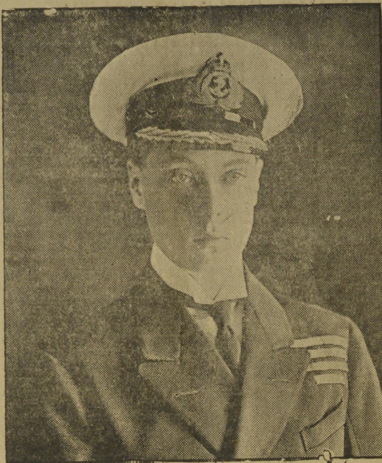
H. R. H. the Prince of Wales in the uniform of a Captain in the Royal Navy, to which rank he has just been gazetted, with seniority from July 6, 1919.