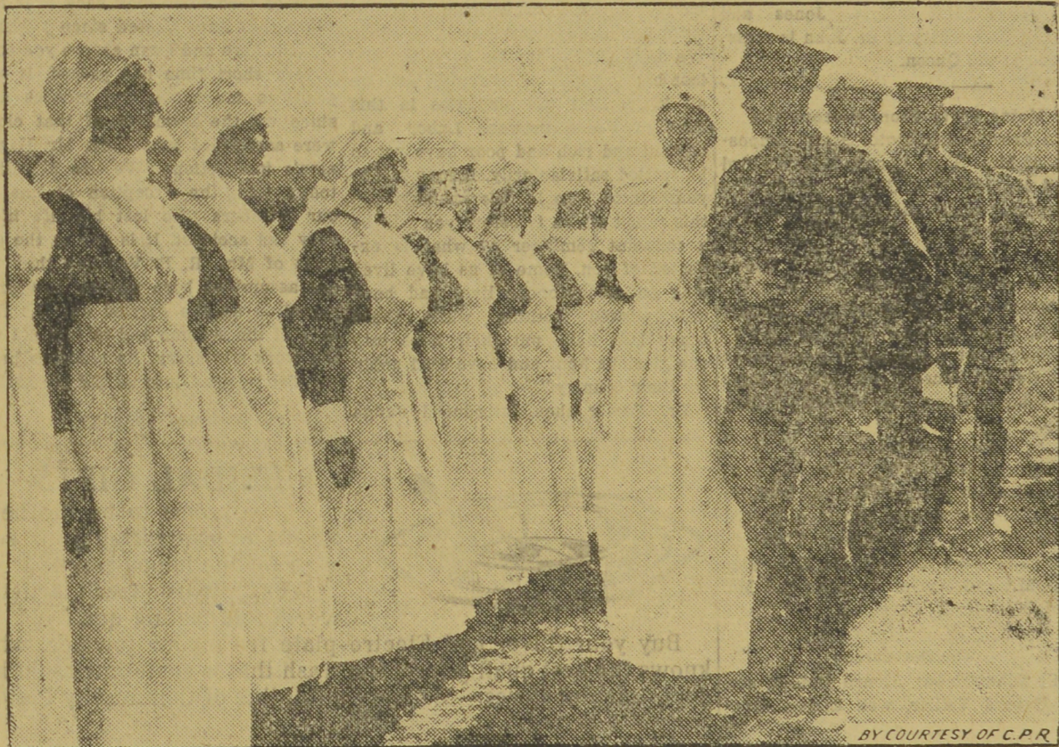
The Prince Inspects Overseas Nurses at Calgary.

London, Sept. 26.—During three days' threshing at a farm near Long Lane, Derbyshire, 1,126 rats were killed.