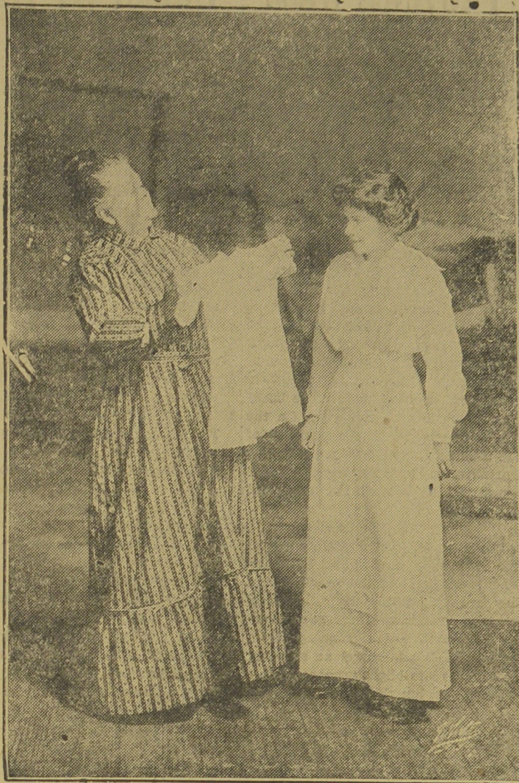
Scene from "Pals First," as presented by the Urban Stock Co. Wednesday Night, October 1st.

Communication with the European continent is steadily improving.