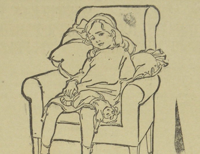
Constipated Children Gladly Take