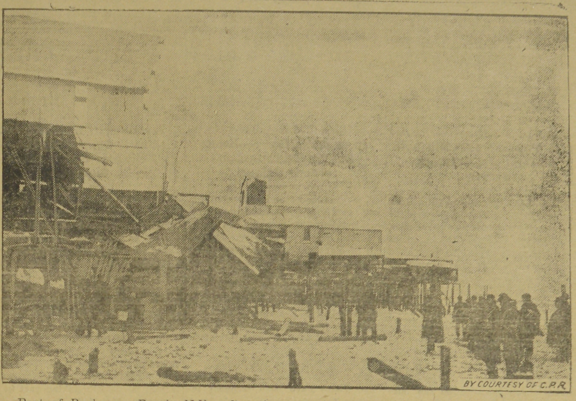
Part of Rockaway Beach, N.Y., after the great storm which smashed four kotels and several iron piers, doing about $2,000,000 damage.

Cholly-I feel like a fool tonight. Miss Keen-So glad you've recov-