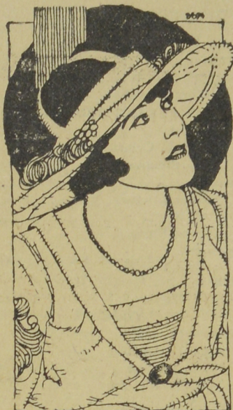
ETHEL CLAYTON in "THE THIRTEENTH COMMANDMENT" A PARAMOUNT-ARTCHART PICTURE