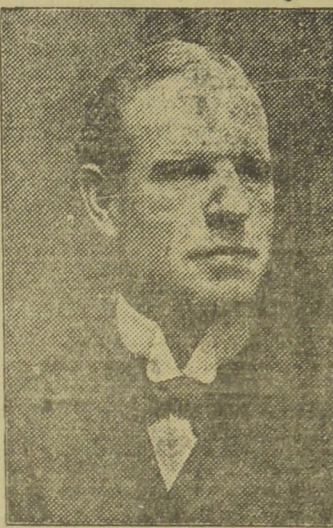
HUME CRONYN, M.P.

Peps provide a new treatment for coughs, colds and lung troubles. They are little tablets made up from Pine extracts and medicinal essences. When put into the mouth these medicinal ingredi- ents turn into healing vapors, which are breathed down direct to the lungs, throat and bronchial tubes. The Peps treatment is direct. Swallowing cough mix- tures into the stomach, to cure ailments and disorders in throat and lungs, is indirect. Peps are revolutionizing the treatment of colds and their price is within the reach of all. All dealers, 50c. box. Send 1c. stamp for FREE TRIAL PACKAGE.