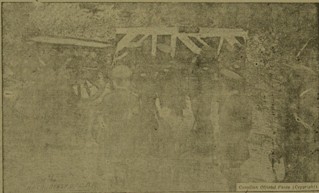
Funeral of General Lipsett near the lines. Taking the coffin from the gun carriage. H.R.H. the Prince of Wales following the coffin.