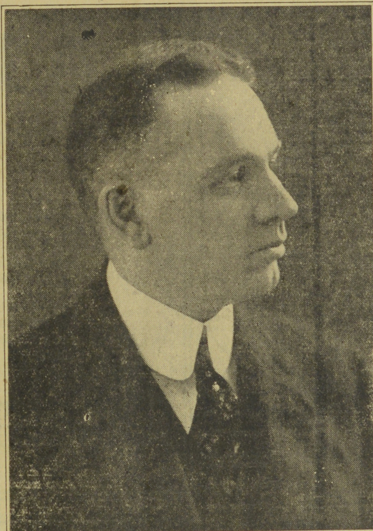
HON. W. E. FOSTER, PREMIER OF NEW BRUNSWICK Who is now appealing for a renewal of public confidence.

and if there is a public conscience they must exercise a tremendous influence in deciding men and women how to vote and how not to vote in the coming contest. There are other pages of the three years and a half of history written since the present government took office which are not so depressing and which must also have their influence in determining the result of the elections. The administration of the crown lands, the extension of good roads, the interest in health matters are a few of the larger events of the three years' rule of the Foster government which command commendation and merit endorsement. Then there is the new policy now taking shape for hydro development on a broad scale to give every section of the province the benefit of that cheaper power which is the essential of industrial success. The government has not contented itself with uncovering the record of its predecessors. It has put into the balance against those misdeeds of a past administration achievements which command the attention