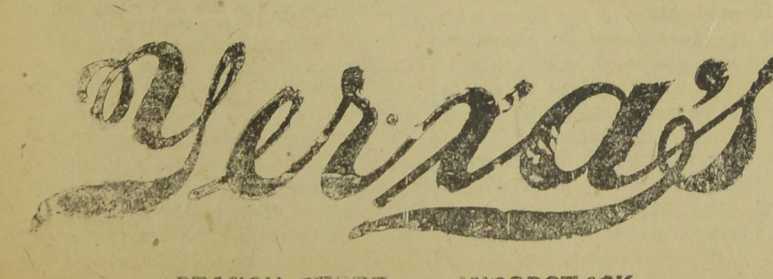
BRANCH STURE - WOODSTUCK