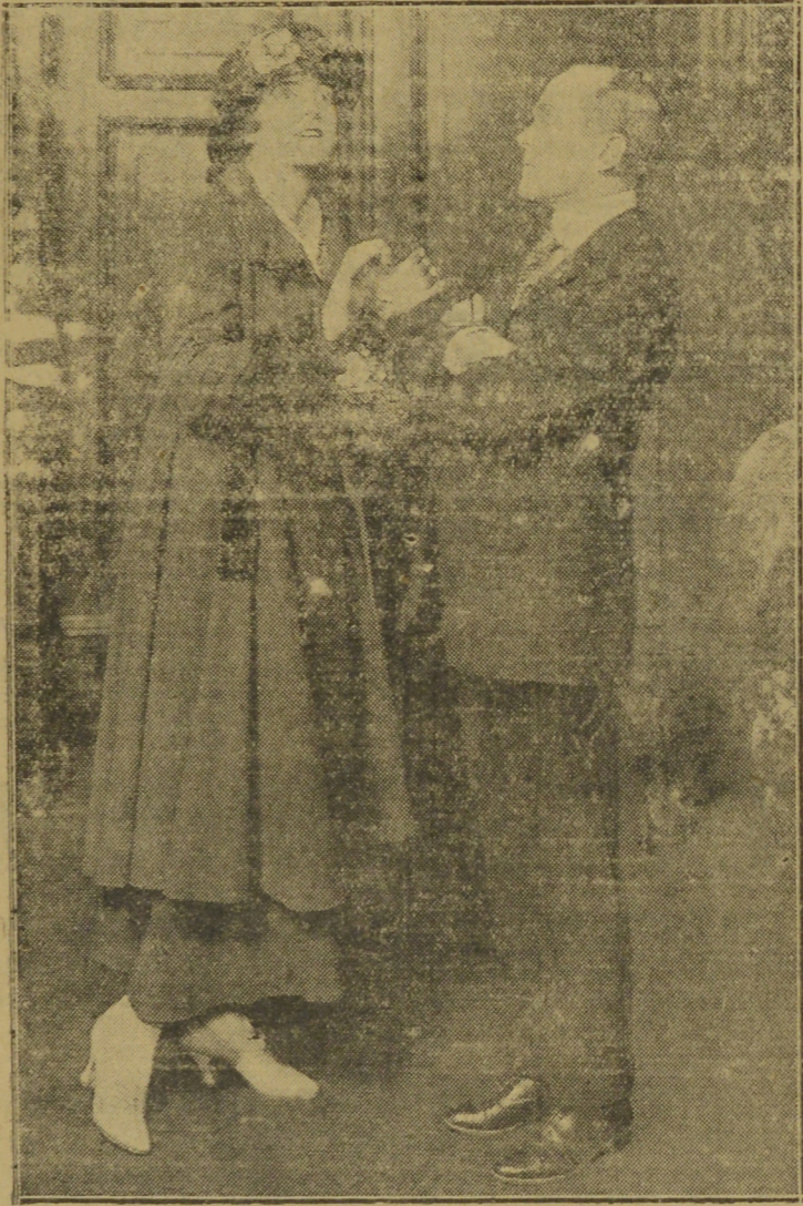
SCENE FROM "A TAILOR MADE MAN."