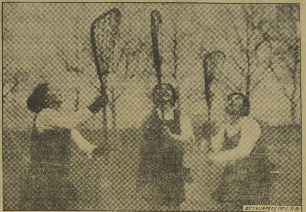
Members of the Ladies' Lacrosse Association playing an exhibition game at Paddington, near London, England.

A safe, reliable regulating medicine. Sold in three degrees of strength—No. 1, $1. No. 2, 50¢. No. 3, 25¢ per box. Sold by all druggists, or sent prepaid on receipt of price. Free pamphlet. Address: THE COOK MEDICINE CO., 7080 7th Ave., New York City.