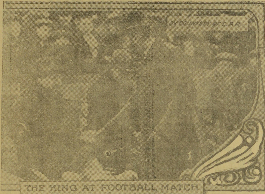
THE KING AT FOOTBALL MATCH