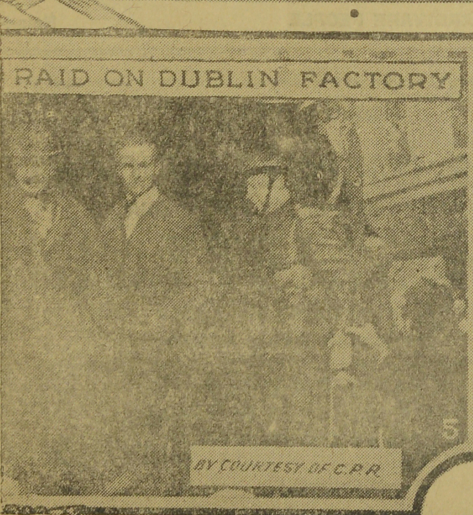
RAID ON DUBLIN FACTORY

(1) The King at Football Cup play-off between Chelsea and Leicester City, at Stamford Bridge. 43,000 spectators cheered when the King shook hands with a number of wounded soldiers and each member of the teams.