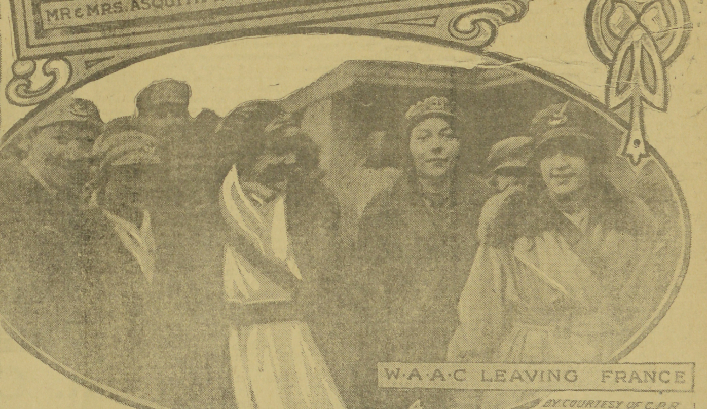
W.A.A.C LEAVING FRANCE