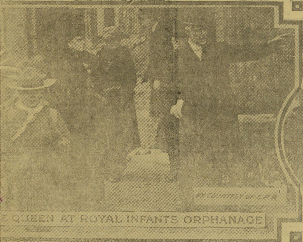
THE QUEEN AT ROYAL INFANTS ORPHANAGE