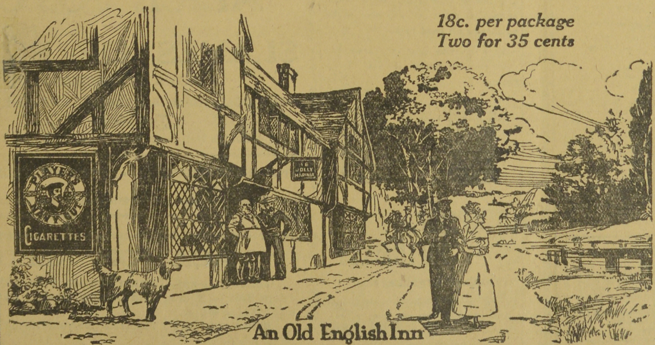
An Old English Inn