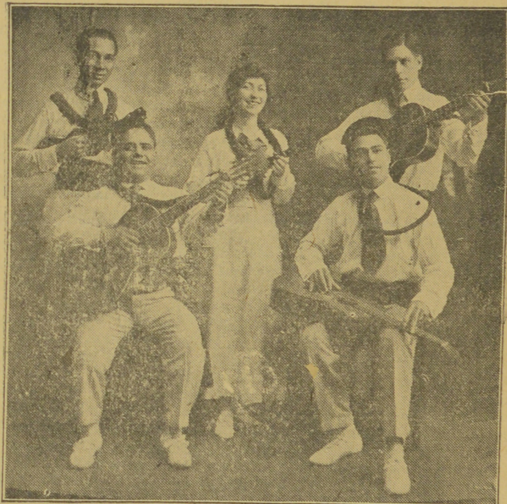
A MUSICAL NOVELTY THAT IS MUSICAL at CHAUTAUQUA Don't fail to hear this company. It's a gem—everyone an artist.

Dandy Bread. High Class Pastry of all kinds 660 Queen Street Phone 102-11