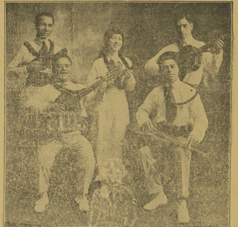
A MUSICAL NOVELTY THAT IS MUSICAL at CHAUTAUQUA Don't fail to hear this company. It's a gem—everyone an artist.