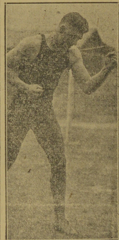
JACK DEMPSEY Loser of the Title.

Round 4—Dempsey sent a left to the jaw, knocking Tunney into the ropes. Tunney hung on as Dempsey drove his fist to the body. Jack chased the challenger into a corner, driving his left to the body. Dempsey was bleeding from a cut on the left eye. Dempsey missed a left hook to the head. Dempsey was short with a left to the head and they clinched. Gene stepped away