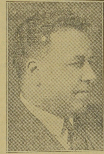
HON. RAYMOND D. MORAND M.D. One of the new ministers without portfolio in the Meighen Cabinet, from his latest photograph. Hon. Dr. Morand represented East Essex in the last House and is again Conservative candidate in that constituency.

(Special cable to The Daily Mail by the British United Press) London, Sept. 8.—The Spanish government is preparing a note announcing Spain's withdrawal from the League of Nations, according to the Daily Mail's Pau (France) correspondent. The note is being drafted for forwarding in the event of the League assembly's rejection of Spain's claim to permanent seat in the League Council expected today, according to the dispatch.