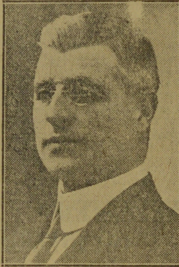
HON. HUGH GUTHRIE

Where you get courteous treatment and prompt service