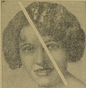
To see the difference, treat ONE SIDE

"The location, having been decided upon," he continues, "allowances is made for the size and number of pens desired, for the alley-ways and for additional pens which might be needed later on. It is a good plan to have a few extra pens. Sometimes a sick or quarrelsome fox, or one requiring isolation, special food or other separate treatment, might with advantage be placed in such a pen. The guard fence should be at least ten feet from the nearest pens as otherwise the foxes might climb on the pens and from there jump over the guard fence and escape. It should be eight feet high, made of boards and an additional 3 or 4 feet of 2-inch mesh wire on top of that with an overhang of two feet, if a snow fence is required; or a fairly cheap fox netting, if in a sheltered place. Try to have a southern exposure. An inside overhang of cheap netting, two feet wide, prevents the foxes from climbing over, and a similar strip on the ground keeps them from digging under the guard fence.