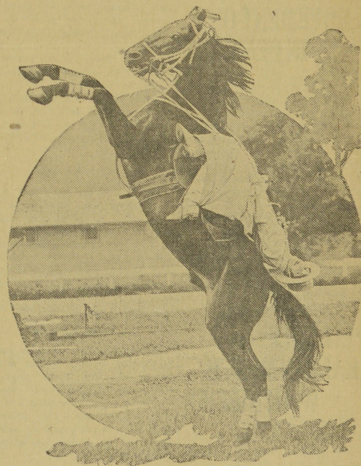
A New Brunswick High School Girl and Her High School Horse One of the Riding Features With Sparks Circus Coming to Fredericton Saturday July 10.

Provincial Secretary-Treasurer, Fredericton May 25th., 1926.