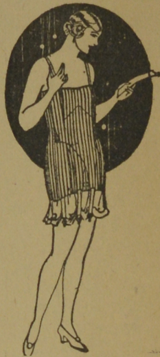
NOWADAYS, GOSSARDS ARE ESSENTIAL

Smart gowns demand Gossard figure garments because they support the natural lines and give that trim smartness that is today's fashion keynote. That's why we recommend this lovely Gossard combination shown here. Particularly designed for the average figure of satin tricot, it has wide elastic inserts which give you ease and suppleness. And the shoulder straps are adjustable and detachable.