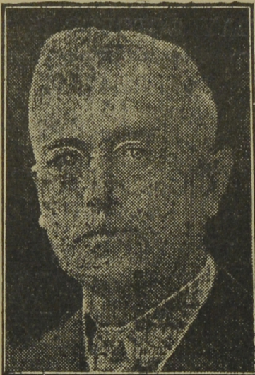
HON. DR. P. J. VENIOT Who Swept Gloucester County.