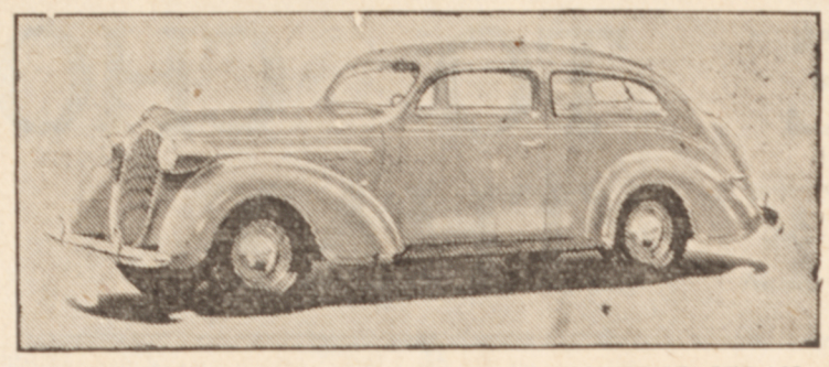
PLYMOUTH DE LUXE TWO-DOOR TOURING SEDAN