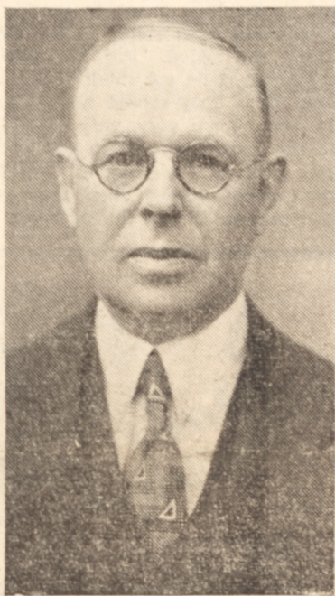
E. J. CORMIER Comptroller-General New Brunswick